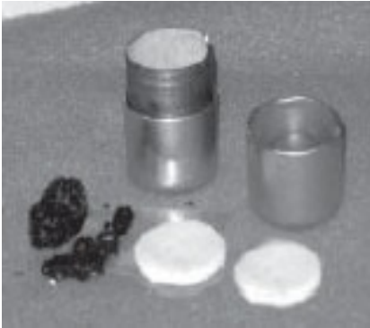
R j q v q " 6