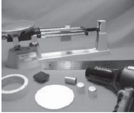
R j q v q " 3