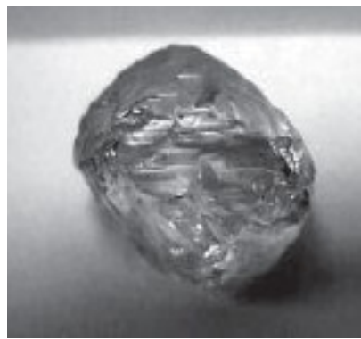
R j q v q " 7