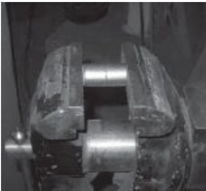
R j q v q " 6