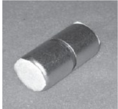
R j q v q " 7