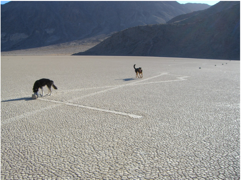
A confused "racer" (the rock) on the high playa located in Northern Death Valley known as "The Racetrack". (Note: the dogs are not confused, just curious and exuberant.)