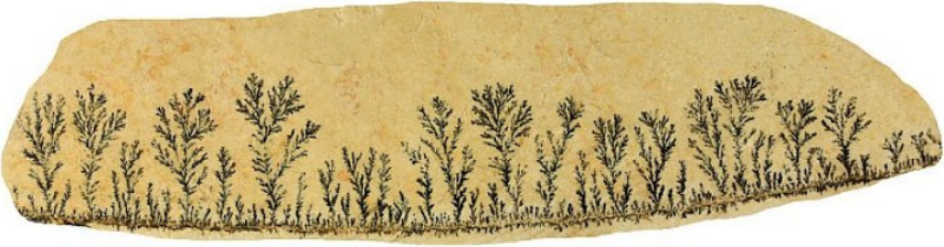
Dendrites of manganese oxide precipitated on the surface of limestone. The sample of Jurassic limestone is from Eichstätt, Bavaria, Germany. Width of view 10 cm.